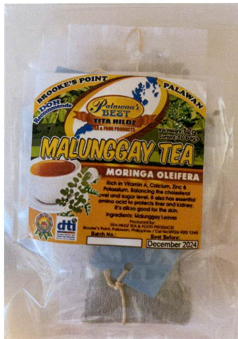
Figure 1. Unregistered PALAWAN'S BEST TITA HILDZ TEA & FOOD PRODUCTS Malunggay Tea Moringa Oleifera

The Food and Drug Administration (FDA) warns all healthcare professionals and the general public NOT TO PURCHASE AND CONSUME the unregistered food product: