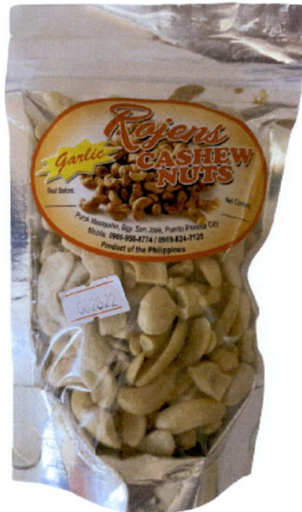
Figure 1. Unregistered ROJENS Cashew Nuts Garlic

The Food and Drug Administration (FDA) warns all healthcare professionals and the general public NOT TO PURCHASE AND CONSUME the unregistered food product: