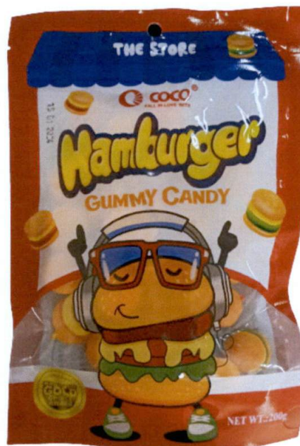
Figure 1. Unregistered COCO FALL IN LOVE WITH Hamburger Gummy Candy

The Food and Drug Administration (FDA) warns all healthcare professionals and the general public NOT TO PURCHASE AND CONSUME the unregistered food product: