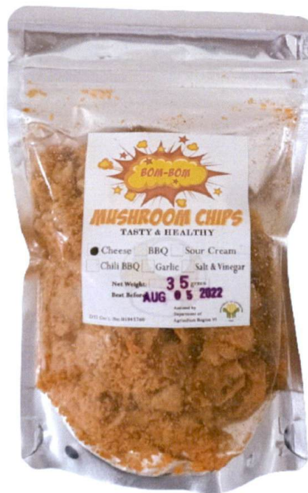
Figure 1. Unregistered BOM-BOM Mushroom Chips Cheese

The Food and Drug Administration (FDA) warns all healthcare professionals and the general public NOT TO PURCHASE AND CONSUME the unregistered food product: