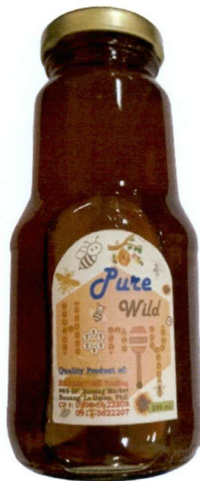
Figure 1. Unregistered Pure Wild Honey

The Food and Drug Administration (FDA) warns all healthcare professionals and the general public NOT TO PURCHASE AND CONSUME the unregistered food product: