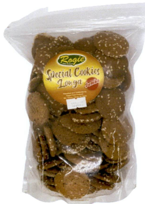
Figure 1. Unregistered ROGIE FOOD PRODUCTS Special Cookies Longa Jumbo

The Food and Drug Administration (FDA) warns all healthcare professionals and the general public NOT TO PURCHASE AND CONSUME the unregistered food product: