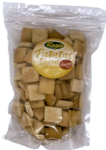
Figure 1. Unregistered ROGIE FOOD PRODUCTS Patatas Special Regular

The Food and Drug Administration (FDA) warns all healthcare professionals and the general public NOT TO PURCHASE AND CONSUME the unregistered food product: