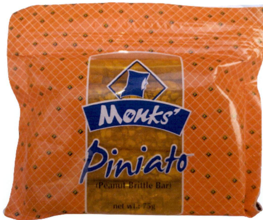
Figure 1. Unregistered MONK'S Piniato (Peanut Brittle Bar)

The Food and Drug Administration (FDA) warns all healthcare professionals and the general public NOT TO PURCHASE AND CONSUME the unregistered food product: