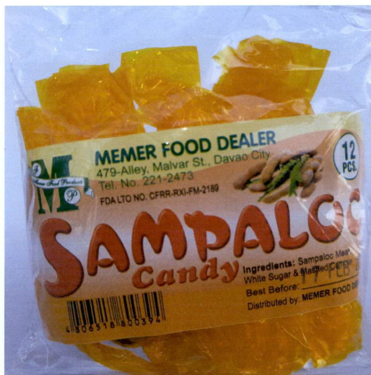
Figure 1. Unregistered MEMER FOOD DEALER Sampaloc Candy

The Food and Drug Administration (FDA) warns all healthcare professionals and the general public NOT TO PURCHASE AND CONSUME the unregistered food product: