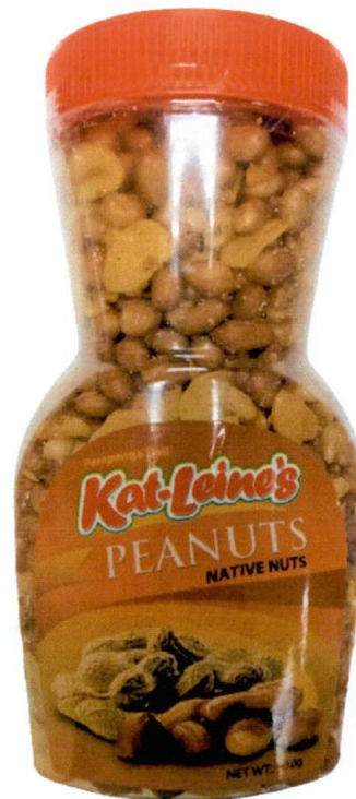
Figure 1. Unregistered KAT-LEINE'S Peanuts Native Nuts

The Food and Drug Administration (FDA) warns all healthcare professionals and the general public NOT TO PURCHASE AND CONSUME the unregistered food product: