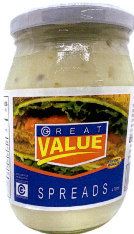
Figure 1. Unregistered GREAT VALUE Spreads

The Food and Drug Administration (FDA) warns all healthcare professionals and the general public NOT TO PURCHASE AND CONSUME the unregistered food product: