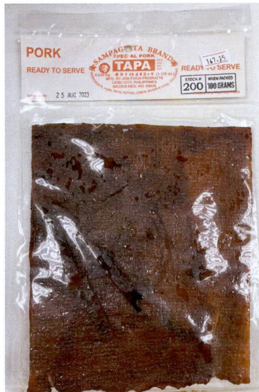
Figure 1. Unregistered SAMPAGUITA BRAND Special Pork Tapa

The Food and Drug Administration (FDA) warns all healthcare professionals and the general public NOT TO PURCHASE AND CONSUME the unregistered food product: