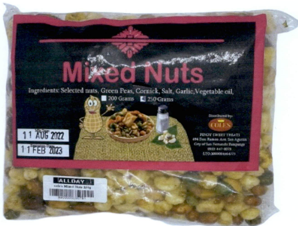
Figure 1. Unregistered COLE'S MIXED NUTS

The Food and Drug Administration (FDA) warns all healthcare professionals and the general public NOT TO PURCHASE AND CONSUME the unregistered food product: