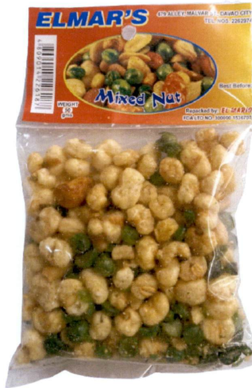
Figure 1. Unregistered ELMAR'S Mixed Nut

The Food and Drug Administration (FDA) warns all healthcare professionals and the general public NOT TO PURCHASE AND CONSUME the unregistered food product: