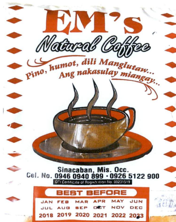
Figure 1. Unregistered EM'S Natural Coffee

The Food and Drug Administration (FDA) warns all healthcare professionals and the general public NOT TO PURCHASE AND CONSUME the unregistered food product: