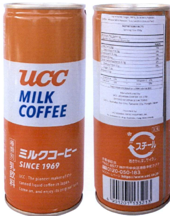
Figure 1. Unregistered UCC Milk Coffee

The Food and Drug Administration (FDA) warns all healthcare professionals and the general public NOT TO PURCHASE AND CONSUME the unregistered food product: