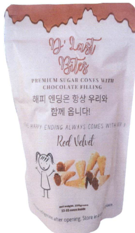
Figure 1. Unregistered D' LAST BITES Premium Sugar Cones with Chocolate Filling Red Velvet

The Food and Drug Administration (FDA) warns all healthcare professionals and the general public NOT TO PURCHASE AND CONSUME the unregistered food product: