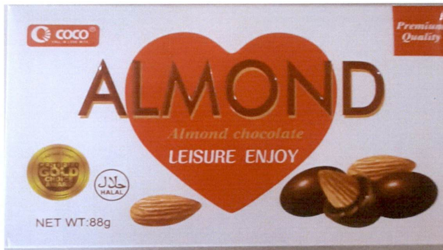
Figure 1. Unregistered COCO Almond Chocolate

The Food and Drug Administration (FDA) warns all healthcare professionals and the general public NOT TO PURCHASE AND CONSUME the unregistered food product: