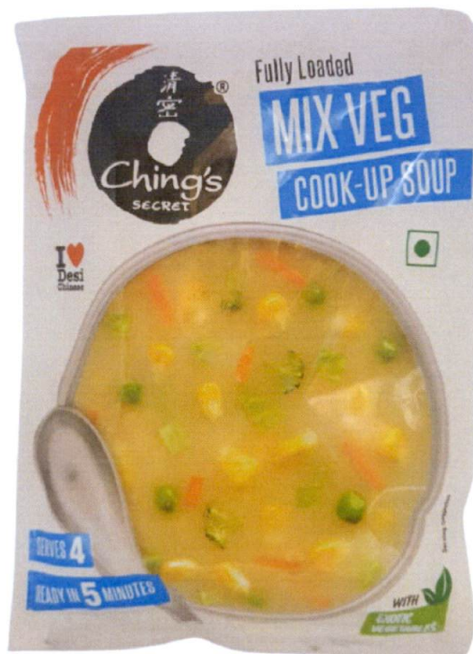
Figure 1. Unregistered CHING'S SECRET Fully Loaded Mix Veg Cook-Up Soup

The Food and Drug Administration (FDA) warns all healthcare professionals and the general public NOT TO PURCHASE AND CONSUME the unregistered food product: