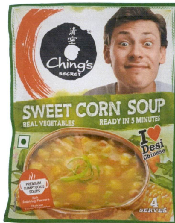
Figure 1. Unregistered CHING'S SECRET Sweet Corn Soup Real Vegetables

The Food and Drug Administration (FDA) warns all healthcare professionals and the general public NOT TO PURCHASE AND CONSUME the unregistered food product: