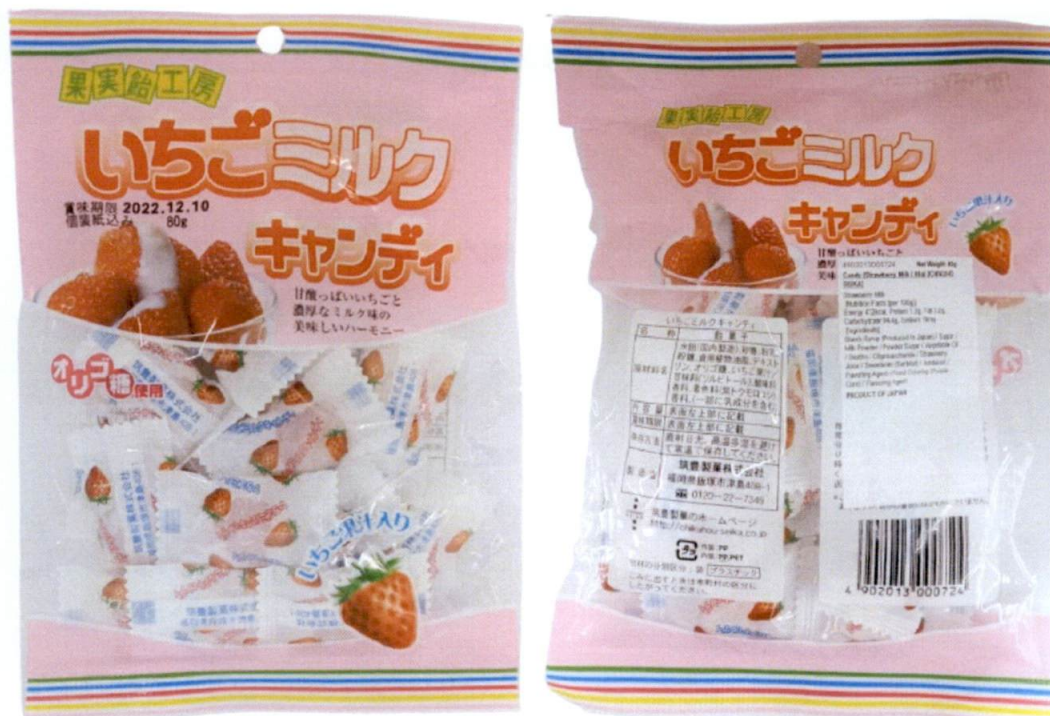
Figure 1. Unregistered CHIKUHO SEIKA Candy (Strawberry Milk) (In Foreign Language)

The Food and Drug Administration (FDA) warns all healthcare professionals and the general public NOT TO PURCHASE AND CONSUME the unregistered food product: