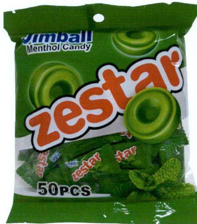
Figure 1. Unregistered ZESTAR Jimball Menthol Candy

The Food and Drug Administration (FDA) warns all healthcare professionals and the general public NOT TO PURCHASE AND CONSUME the unregistered food product: