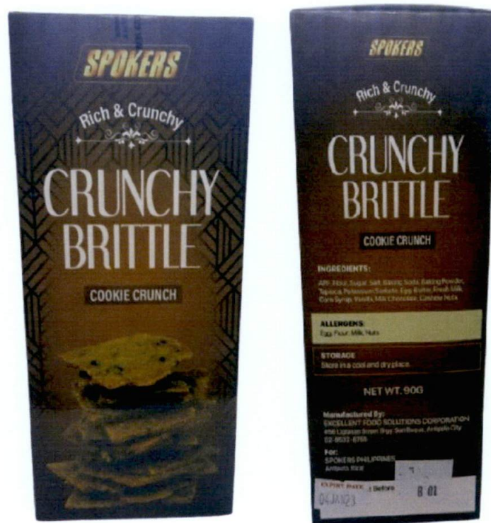
Figure 1. Unregistered SPOKERS Crunchy Brittle Cookie Crunch

The Food and Drug Administration (FDA) warns all healthcare professionals and the general public NOT TO PURCHASE AND CONSUME the unregistered food product: