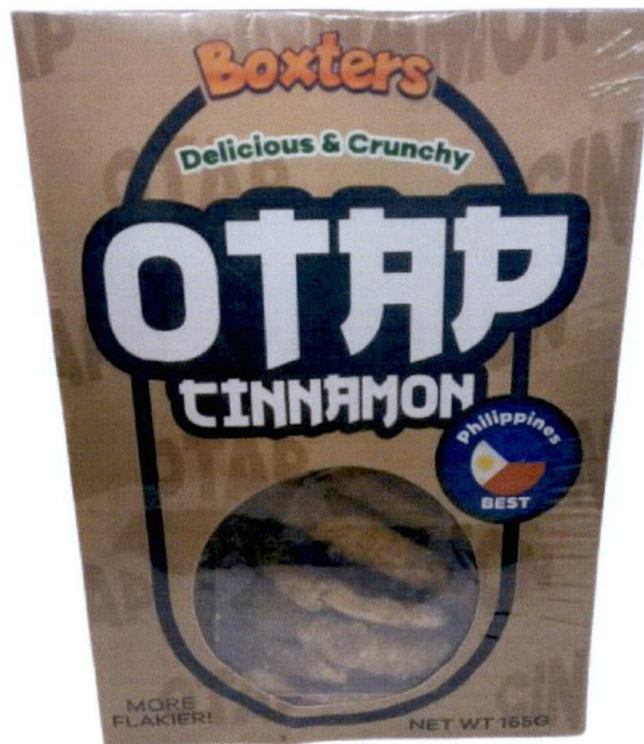
Figure 1. Unregistered BOXTERS Otap Cinnamon

The Food and Drug Administration (FDA) warns all healthcare professionals and the general public NOT TO PURCHASE AND CONSUME the unregistered food product: