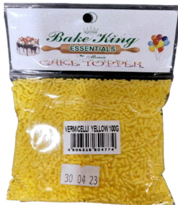
Figure 1. Unregistered BAKE KING ESSENTIAL BY MEMER Cake Topper Vermicelli Yellow

The Food and Drug Administration (FDA) warns all healthcare professionals and the general public NOT TO PURCHASE AND CONSUME the unregistered food product: