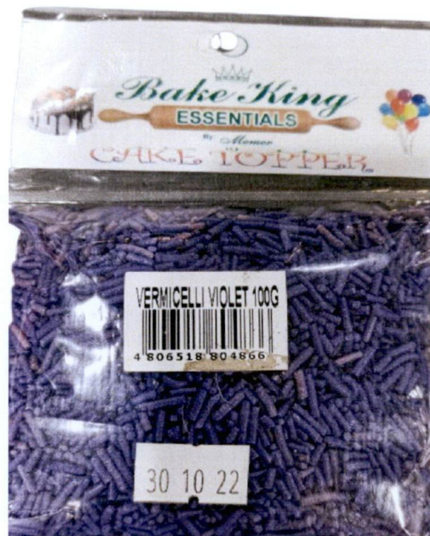
Figure 1. Unregistered BAKE KING ESSENTIAL BY MEMER Cake Topper Vermicelli Violet

The Food and Drug Administration (FDA) warns all healthcare professionals and the general public NOT TO PURCHASE AND CONSUME the unregistered food product: