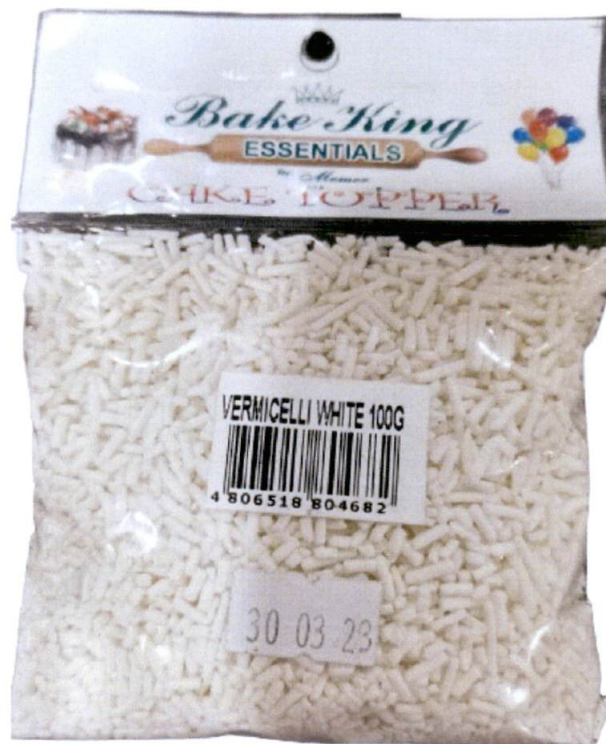
Figure 1. Unregistered BAKE KING ESSENTIAL BY MEMER Cake Topper Vermicelli White

The Food and Drug Administration (FDA) warns all healthcare professionals and the general public NOT TO PURCHASE AND CONSUME the unregistered food product: