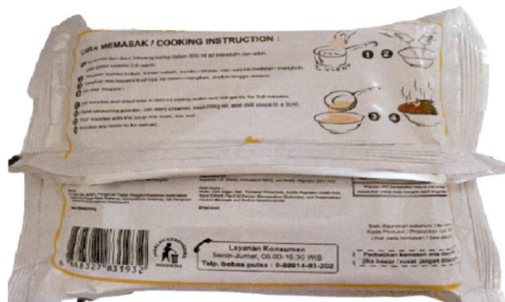
Figure 1. Unregistered ARIRANG Noodle Soup Bone Marrow