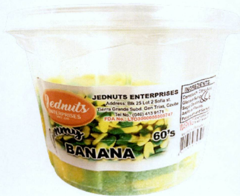
Figure 1. Unregistered (UNBRANDED) Gummy Banana

The Food and Drug Administration (FDA) warns all healthcare professionals and the general public NOT TO PURCHASE AND CONSUME the unregistered food product: