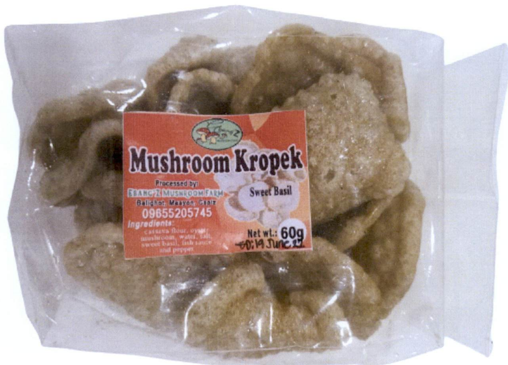
Figure 1. Unregistered EBANG'Z Mushroom Kropek

The Food and Drug Administration (FDA) warns all healthcare professionals and the general public NOT TO PURCHASE AND CONSUME the unregistered food product: