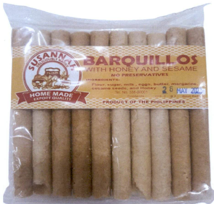
Figure 1. Unregistered SUSANNAH DELICIOUSLY NATIVE HOMEMADE EXPORT QUALITY Barquillos with Honey and Sesame

The Food and Drug Administration (FDA) warns all healthcare professionals and the general public NOT TO PURCHASE AND CONSUME the unregistered food product: