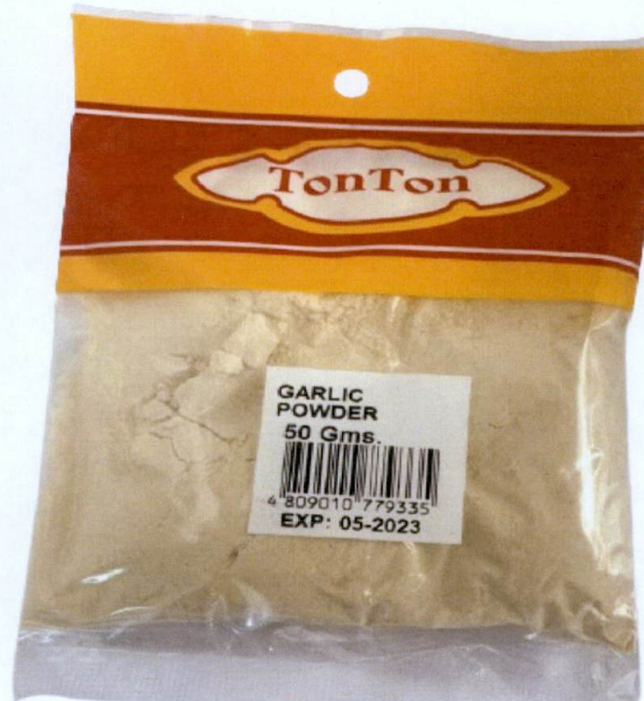
Figure 1. Unregistered TONTON Garlic Powder

The Food and Drug Administration (FDA) warns all healthcare professionals and the general public NOT TO PURCHASE AND CONSUME the unregistered food product: