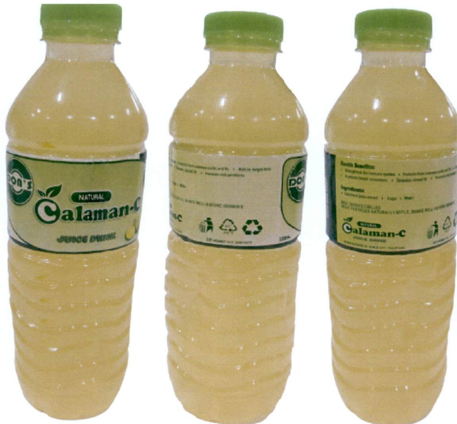
Figure 1. Unregistered DON'S Natural Calaman-C Juice Drink

The Food and Drug Administration (FDA) warns all healthcare professionals and the general public NOT TO PURCHASE AND CONSUME the unregistered food product: