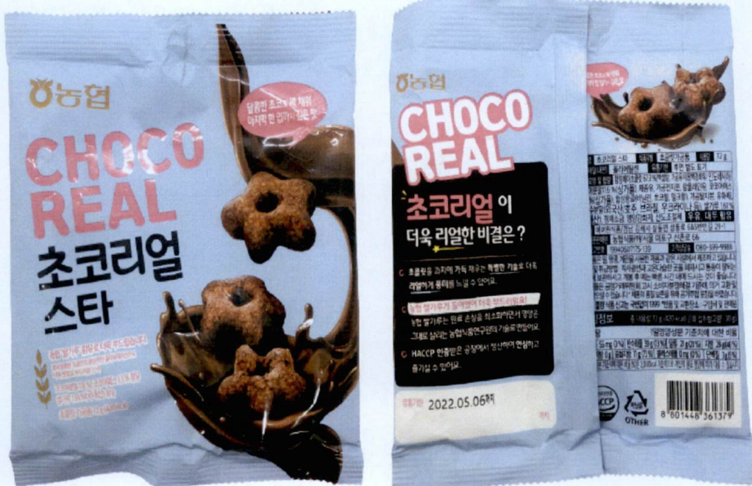
Figure 1. Unregistered CHOCO REAL Chocolate Star-Shaped Rice Crispies in Light Blue Packaging

The Food and Drug Administration (FDA) warns all healthcare professionals and the general public NOT TO PURCHASE AND CONSUME the unregistered food product: