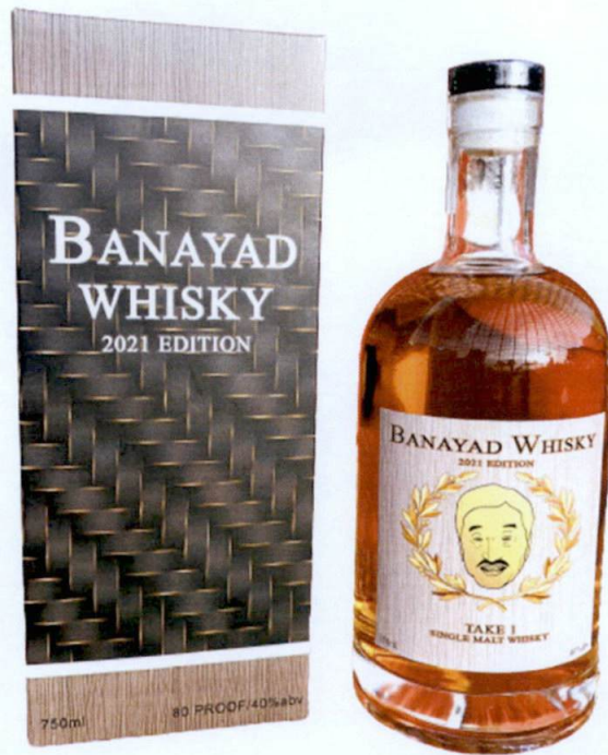
Figure 2. Unregistered BANAYAD WHISKY 2021 EDITION Take 1 Single Malt Whiskey 40% abv, 750ml