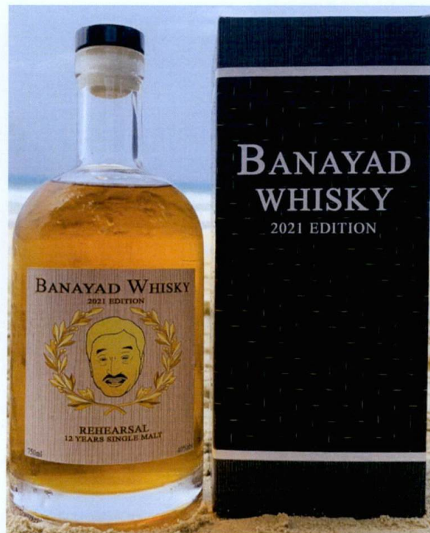
Figure 1. Unregistered BANAYAD WHISKY 2021 EDITION Rehearsal 12 years Single Malt 40% abv, 750ml

The Food and Drug Administration (FDA) warns all healthcare professionals and the general public NOT TO PURCHASE AND CONSUME the following unregistered food products: