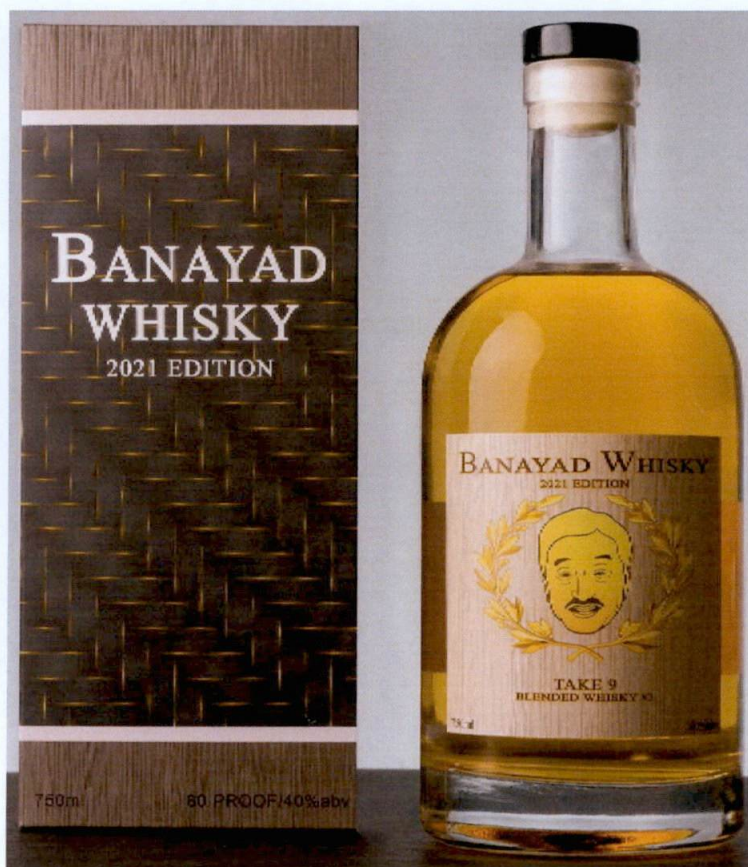
Figure 5. Unregistered BANAYAD WHISKY 2021 EDITION Take 9 Blended Whisky #3 40% abv, 750ml