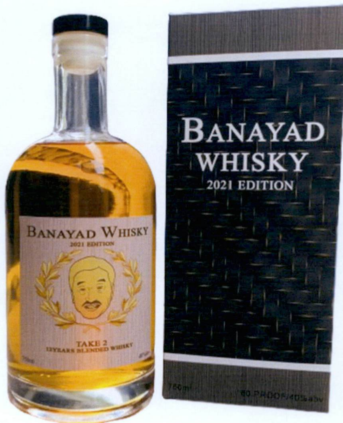
Figure 3. Unregistered BANAYAD WHISKY 2021 EDITION Take 2 12 years Blended Whisky 40% abv, 750ml