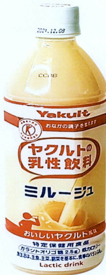
Figure 2. Unregistered YAKULT Lactic Drink in Plastic Bottle (In Foreign Language)

The FDA verified through online monitoring or post-marketing surveillance that the abovementioned food products are not registered and no corresponding Certificates of Product Registration (CPR) have been issued. Pursuant to the Republic Act No. 9711, otherwise known as the “Food and Drug Administration Act of 2009”, the manufacture, importation, exportation, sale, offering for sale, distribution, transfer, non-consumer use, promotion, advertising or sponsorship of health products without the proper authorization is prohibited.