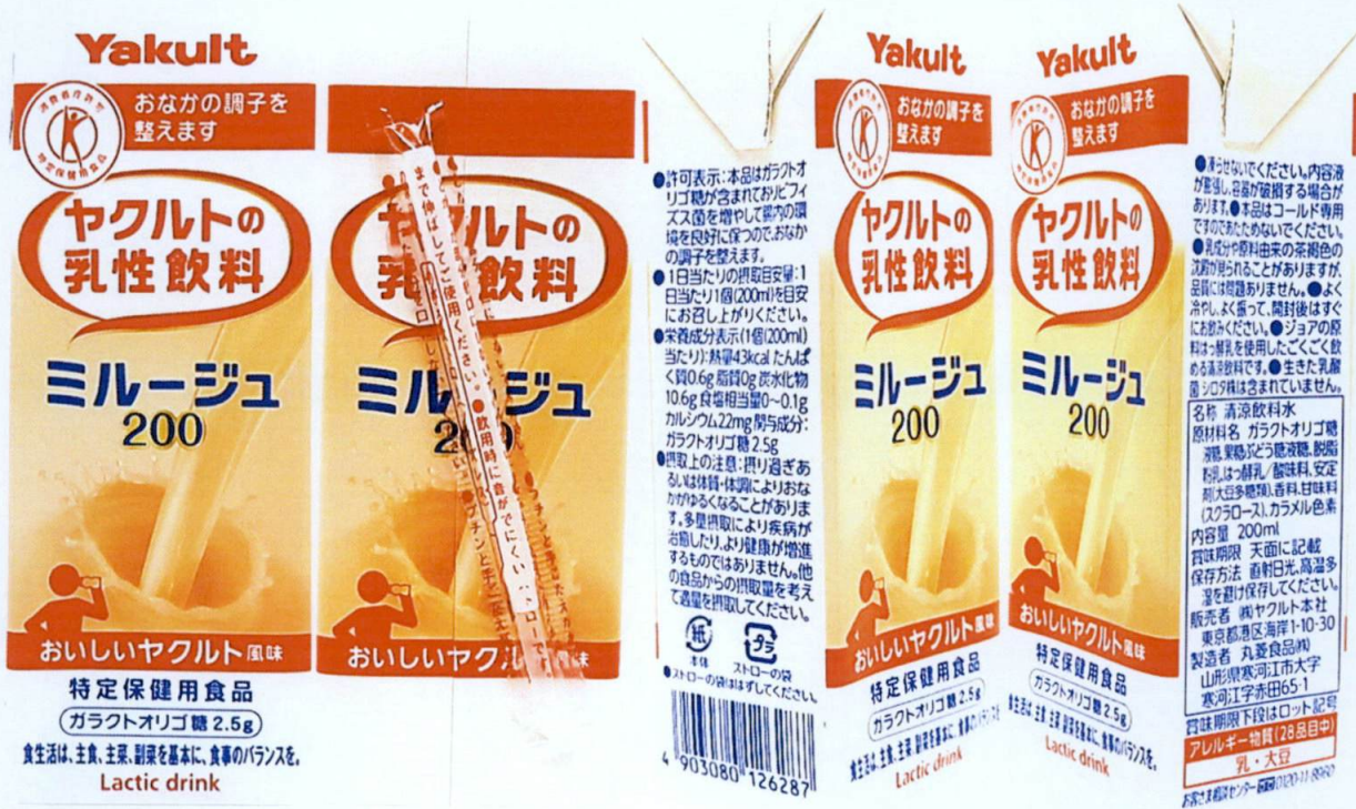
Figure 1. Unregistered YAKULT Lactic Drink 200 in Tetrapack (In Foreign Language)

The Food and Drug Administration (FDA) warns all healthcare professionals and the general public NOT TO PURCHASE AND CONSUME the following unregistered food products: