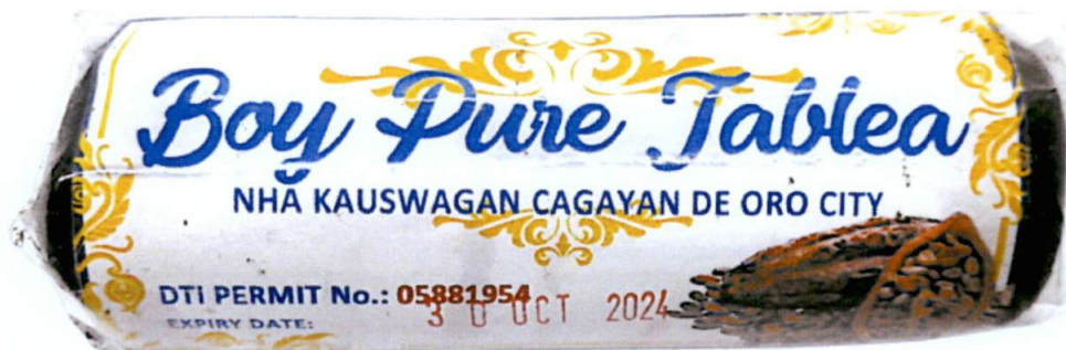
Figure 1. Unregistered BOY PURE Tablea

The Food and Drug Administration (FDA) warns all healthcare professionals and the general public NOT TO PURCHASE AND CONSUME the unregistered food product: