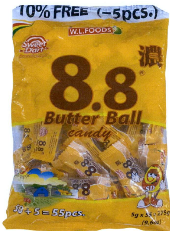
Figure 1. Unregistered W.L. FOODS SWEET DART 8.8 Butter Ball Candy

The Food and Drug Administration (FDA) warns all healthcare professionals and the general public NOT TO PURCHASE AND CONSUME the unregistered food product: