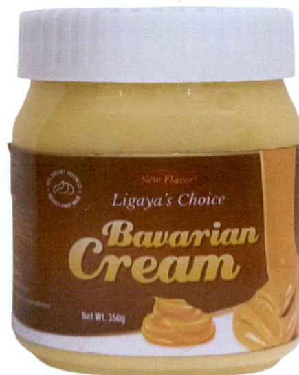
Figure 1. Unregistered LIGAYA'S CHOICE Bavarian Cream

The Food and Drug Administration (FDA) warns all healthcare professionals and the general public NOT TO PURCHASE AND CONSUME the unregistered food product: