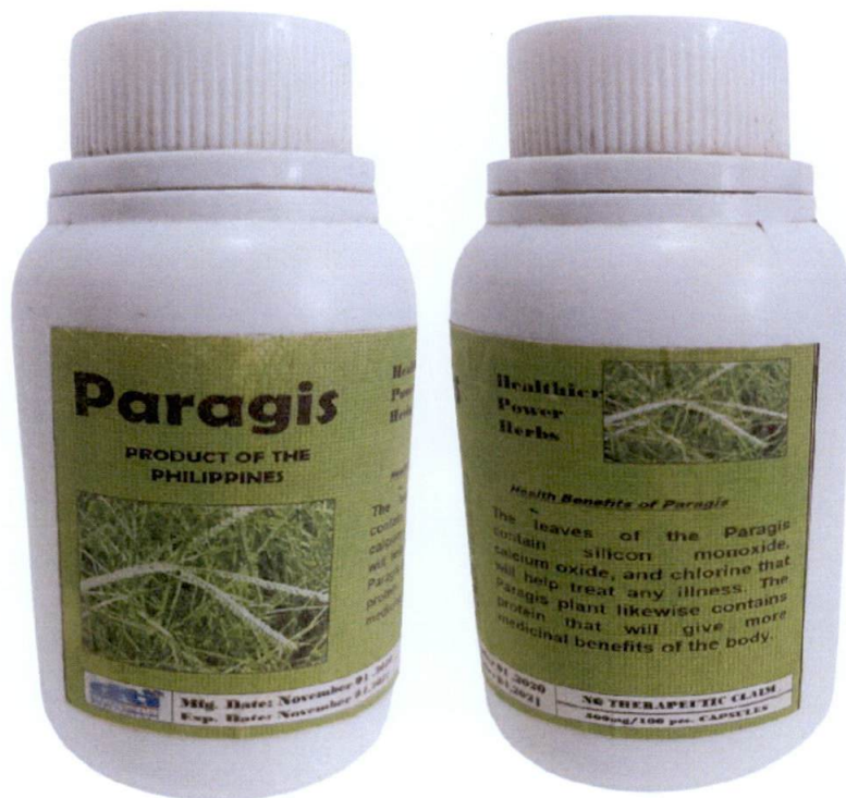
Figure 1. Unregistered PARAGIS Healthier Power Herbs

The Food and Drug Administration (FDA) warns all healthcare professionals and the general public NOT TO PURCHASE AND CONSUME the unregistered food supplement: