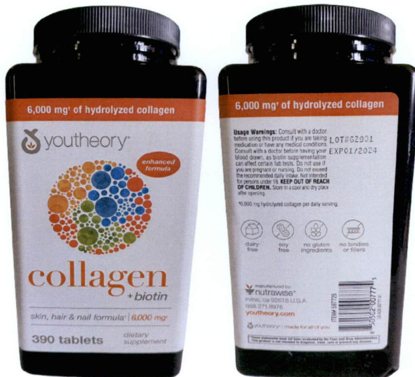
Figure 1. Unregistered YOUTHEORY Collagen + Biotin Dietary Supplement

The Food and Drug Administration (FDA) warns all healthcare professionals and the general public NOT TO PURCHASE AND CONSUME the unregistered food supplement: