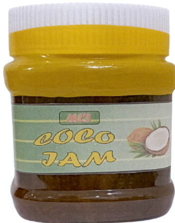
Figure 1. Unregistered MLJ Coco Jam

The Food and Drug Administration (FDA) warns all healthcare professionals and the general public NOT TO PURCHASE AND CONSUME the unregistered food product: