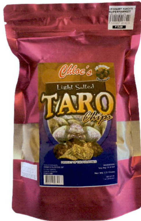
Figure 1. Unregistered CHLOE'S Light Salted Taro Chips

The Food and Drug Administration (FDA) warns all healthcare professionals and the general public NOT TO PURCHASE AND CONSUME the unregistered food product: