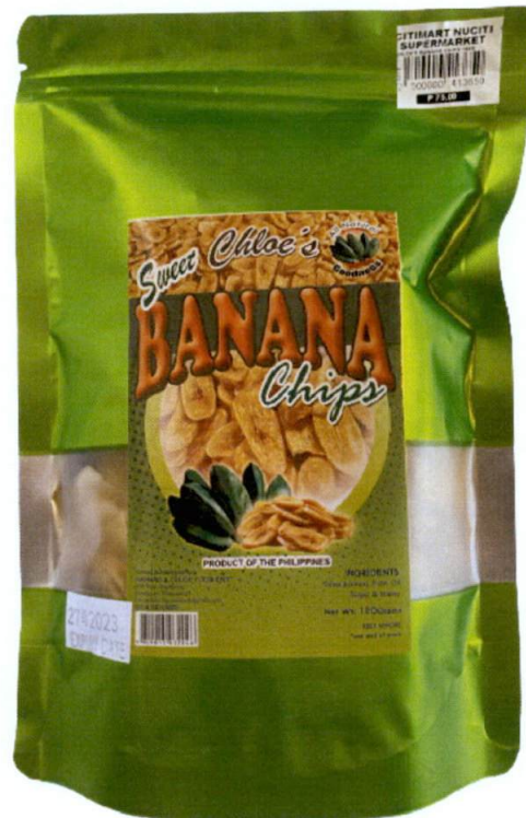
Figure 1. Unregistered SWEET CHLOE'S Banana Chips

The Food and Drug Administration (FDA) warns all healthcare professionals and the general public NOT TO PURCHASE AND CONSUME the unregistered food product: