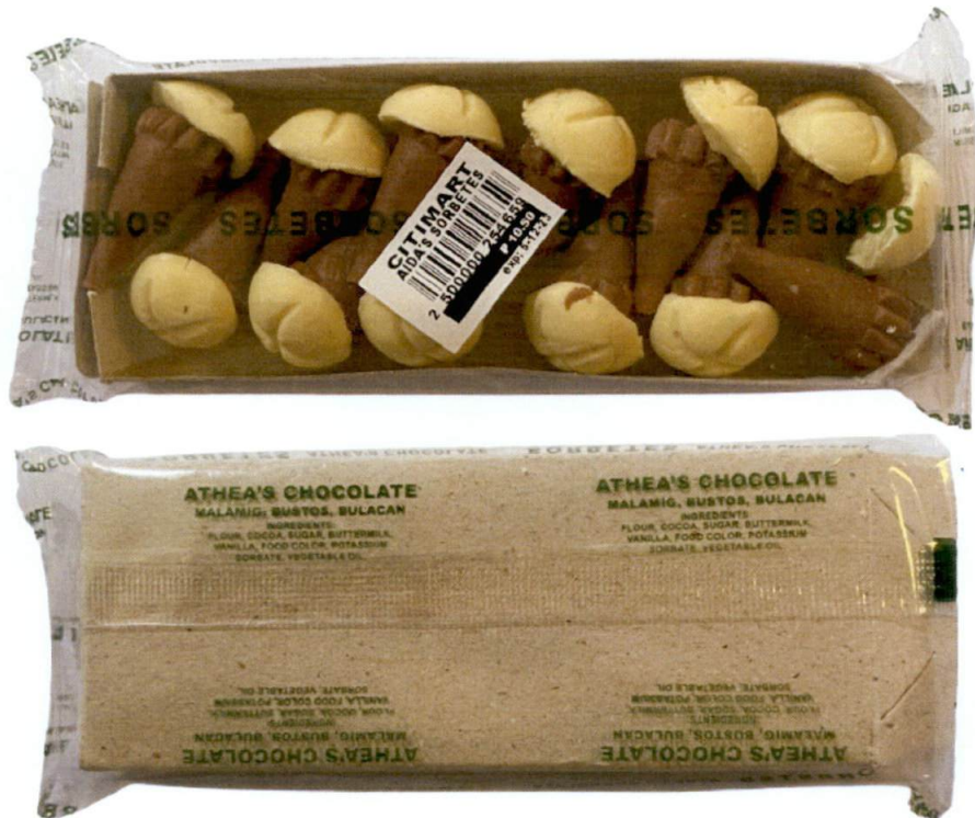
Figure 1. Unregistered ATHEA'S CHOCOLATE Sorbetes

The Food and Drug Administration (FDA) warns all healthcare professionals and the general public NOT TO PURCHASE AND CONSUME the unregistered food product: