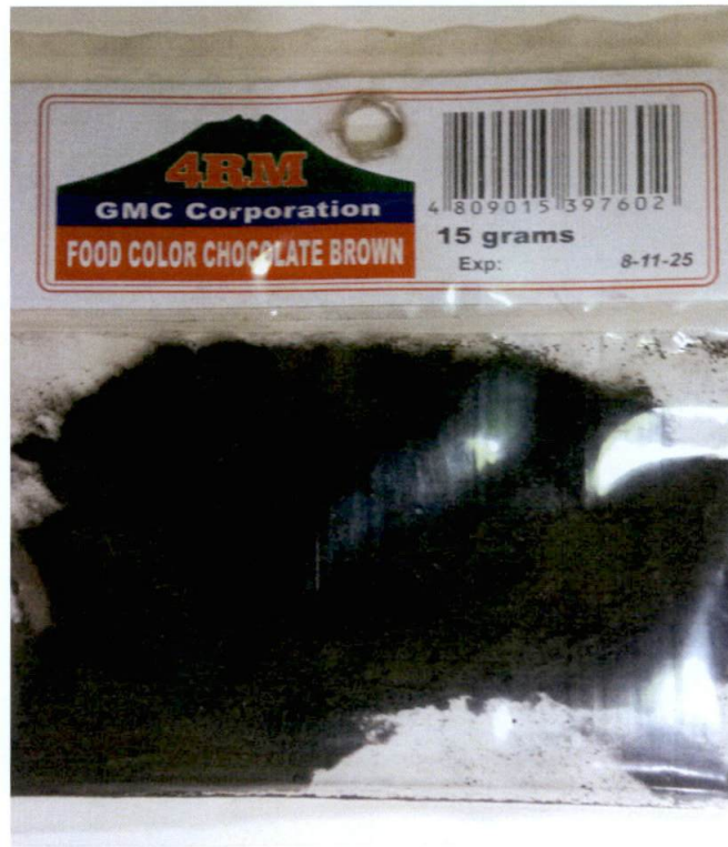
Figure 1. Unregistered 4RM Food Color Chocolate Brown

The Food and Drug Administration (FDA) warns all healthcare professionals and the general public NOT TO PURCHASE AND CONSUME the unregistered food product: