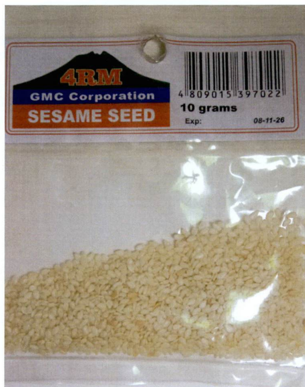
Figure 1. Unregistered 4RM Sesame Seed

The Food and Drug Administration (FDA) warns all healthcare professionals and the general public NOT TO PURCHASE AND CONSUME the unregistered food product: