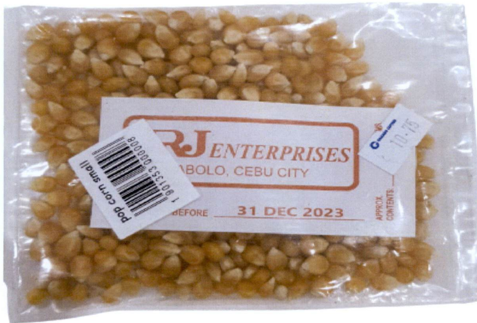
Figure 1. Unregistered JRJ ENTERPRISES Pop Corn - Small

The Food and Drug Administration (FDA) warns all healthcare professionals and the general public NOT TO PURCHASE AND CONSUME the unregistered food product: