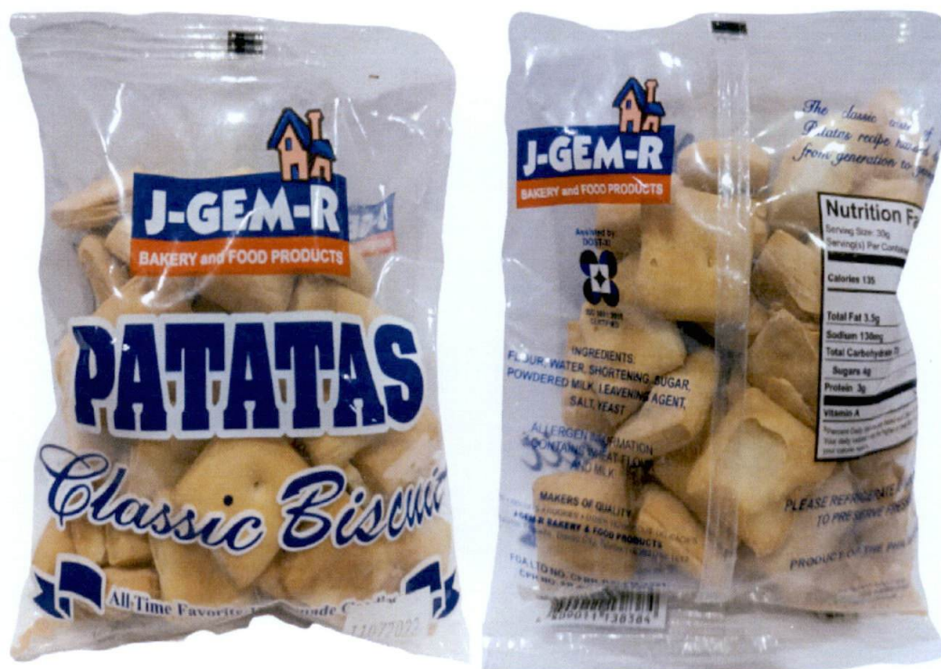
Figure 1. Unregistered J-GEM-R BAKERY AND FOOD PRODUCTS Patatas Classic Biscuit

The Food and Drug Administration (FDA) warns all healthcare professionals and the general public NOT TO PURCHASE AND CONSUME the unregistered food product: