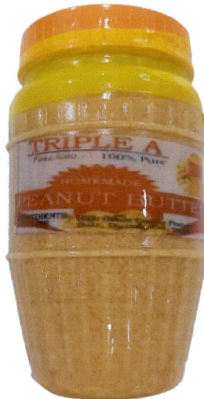
Figure 1. Unregistered TRIPLE A Homemade Peanut Butter

The Food and Drug Administration (FDA) warns all healthcare professionals and the general public NOT TO PURCHASE AND CONSUME the unregistered food product: